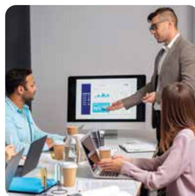
Operations, Products and Fulfilment Team