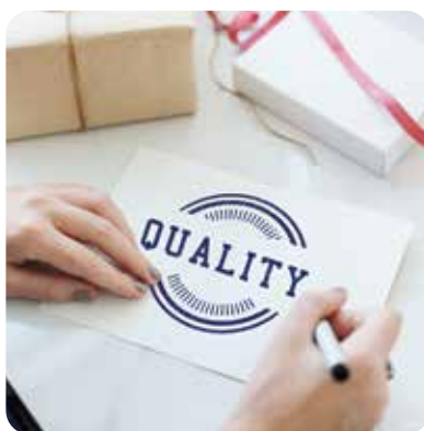
Quality and Audits