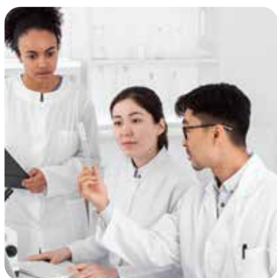
Research and Training