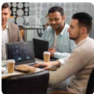
People Development Department and Ethics Team